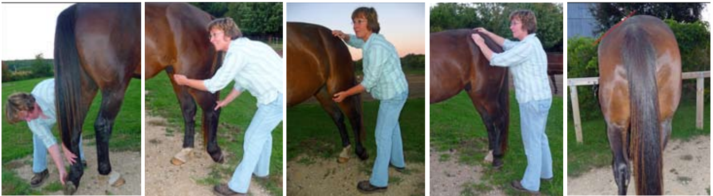
Horse model: Bell Valley Yank

Exercise 1: Place your horse's hind leg in a resting position, slightly further back than usual. With one hand on the hock, the other on his stifle, gently wiggle his leg by using hand on the stifle as a fulcrum. Any resistance or forced movement is counter-productive. Watch your horse's responses and continue as long as he relaxes into it.